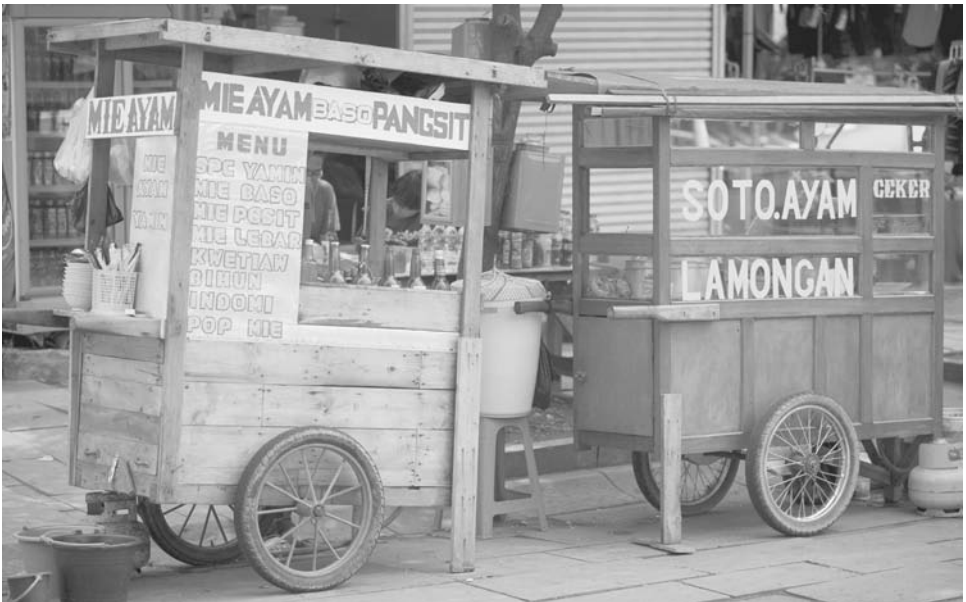
Indonesian food carts featuring noodle dishes in Kota, Jakarta, Indonesia.

A very popular lunch dish, gado gado , is a cooked vegetable salad served in a sweet hot peanut sauce and garnished with eggs, cucumbers, and onions. The vegetables can include cabbage, cauliflower, carrots, beans, and bean sprouts.